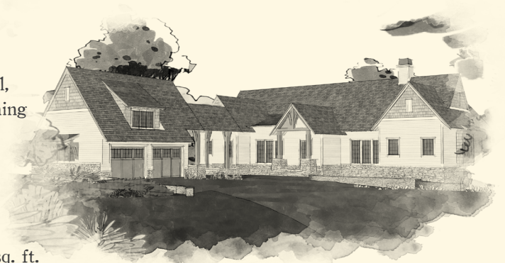
Street Side Elevation

PRICE: With the varied size of the homes and lot selection, pricing will depend on final features and lot selection.