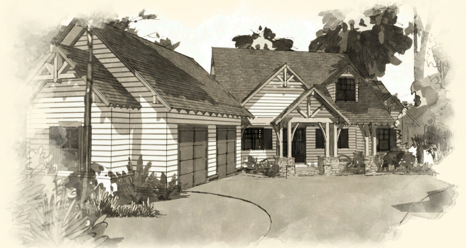
Street Side Elevation

PRICE: Pricing will depend on final features and lot selection.